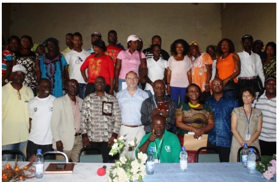
DCrvississeMathlesbaydTerace pessedrfNACP photokingha BartementPeter Piot